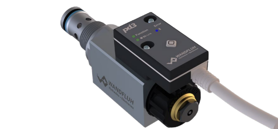
Valve with IO-Link electronics (PD3)